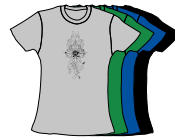
COSMA male female