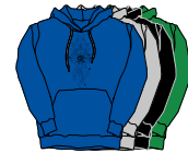
COSMA male hooded